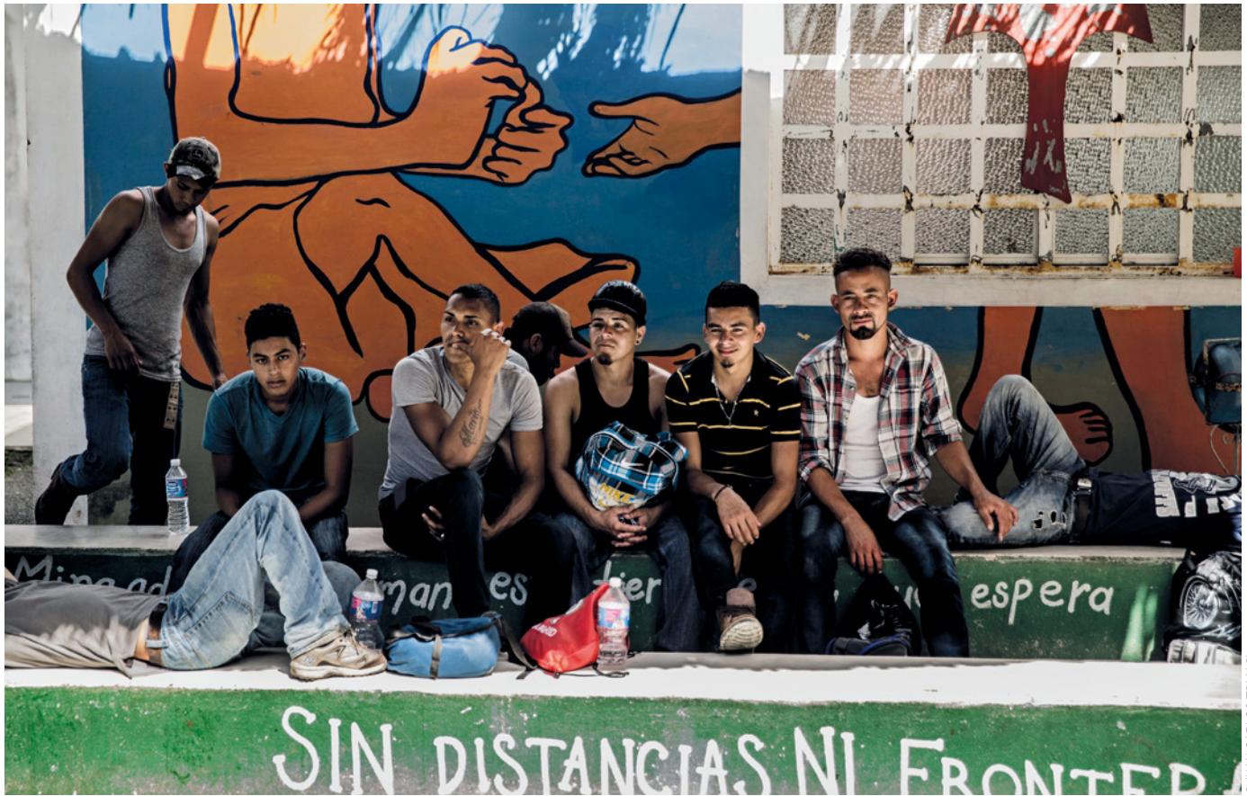
Migrants and refugees wait to register at La 72 shelter in Tenosique, Tabasco, Mexico.