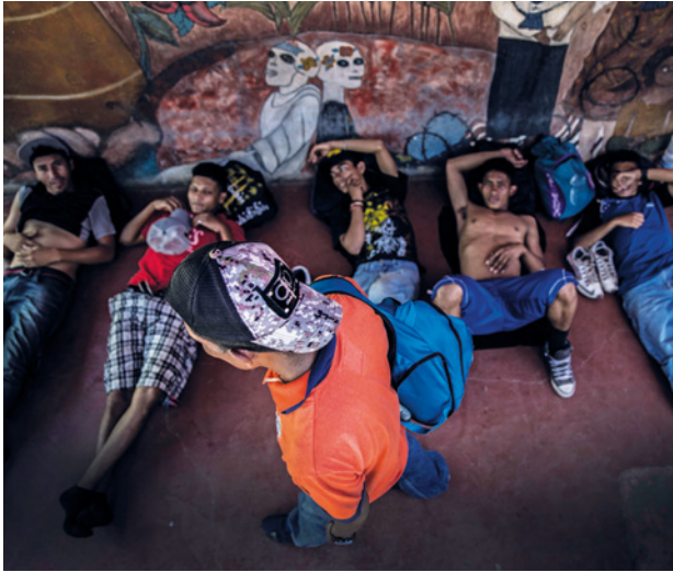
La 72 shelter in Tenosique, Tabasco, Mexico.

21 days and it's unbearable to see so many people, so many women with their children.... Being here is the most horrible thing that has happened to me in my life. You can't do anything, the heat is unbearable. People are crying and screaming, they're in despair, and you can't do anything. The children are not eating, but who is going to eat this undercooked, rotten food? Not to mention the stench from the restrooms.... None of the workers look you in the face; I believe it is because, if they look at you, they would see the suffering, that we aren't being held in suitable conditions. This is sad, inhumane and disgusting. There isn't any water. I have only had a wash three times in 21 days. My children have rashes from the sweat and dirt. I can't go to the toilet because they are overflowing, and the stench overpowers everything. Sometimes I think this is hell, and when I think that, sadness washes over me and I can't stop crying. My babies look at me and hug me, and I realize they are crying too. What can I do? Now I want to see my husband and tell him that we won't wait any longer, that they can deport us if they like, but let us out of here now. If they are going to kill us, we would at least be seeing the sky, feeling the air, feeling free. But I don't want to die of sadness and loneliness here —worse than an animal, worse than anything, worse than nothing”.