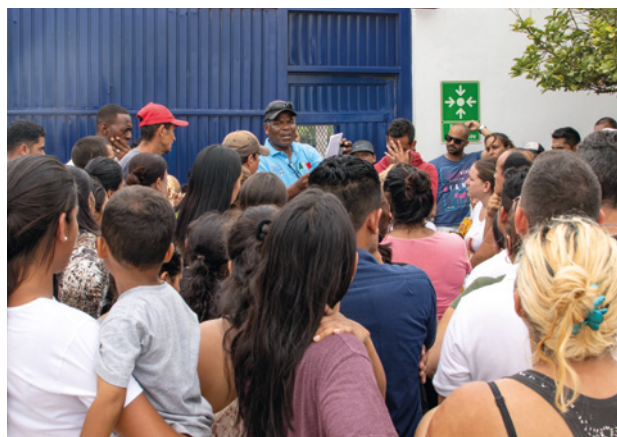
Migrants are exposed to danger in Reynosa, Tamaulipas, Mexico.

"There is a lot of crime. We already have been through years on the move. We were living in Guatemala and migrated to Mexico, because there is also crime in Guatemala. When we crossed the river into Mexico, they seized us and deported us. When [later] we arrived in El Salvador, [the gang] asked us for 'rent' because we hadn't lived there before. So we had to pay, because if you don't pay, they come for you. People suffer a lot by having to run away from our country. Now I don't have anywhere to go in El Salvador; I sought asylum but they rejected me. I had no alternative but to leave and walk. We arrived in La Venta [Mexico], and there the migration authorities beat us. A human rights organization took photos of the wounds on my back. We are looking after each other. We have crossed mountains, passed through dangerous places, traveling by other ways; we have jumped onto moving trains, although they say that on the train you run the risk of being kidnapped or attacked. There are some people who lost parts of their body while trying to get onto the train, but we don't have any other choice. We have to migrate in order to be able to live a little better".