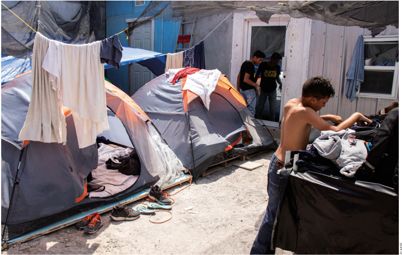
Asylum seekers sent back to Mexico by the US are living in a makeshift camp by the international bridge between Matamoros, Tamaulipas, Mexico, and Brownsville, Texas.