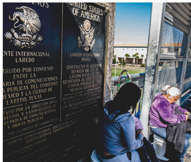
Asylum seekers wait at the international bridge between Nuevo Laredo, Tamaulipas, Mexico, and Laredo, Texas, to apply for protection in the US.