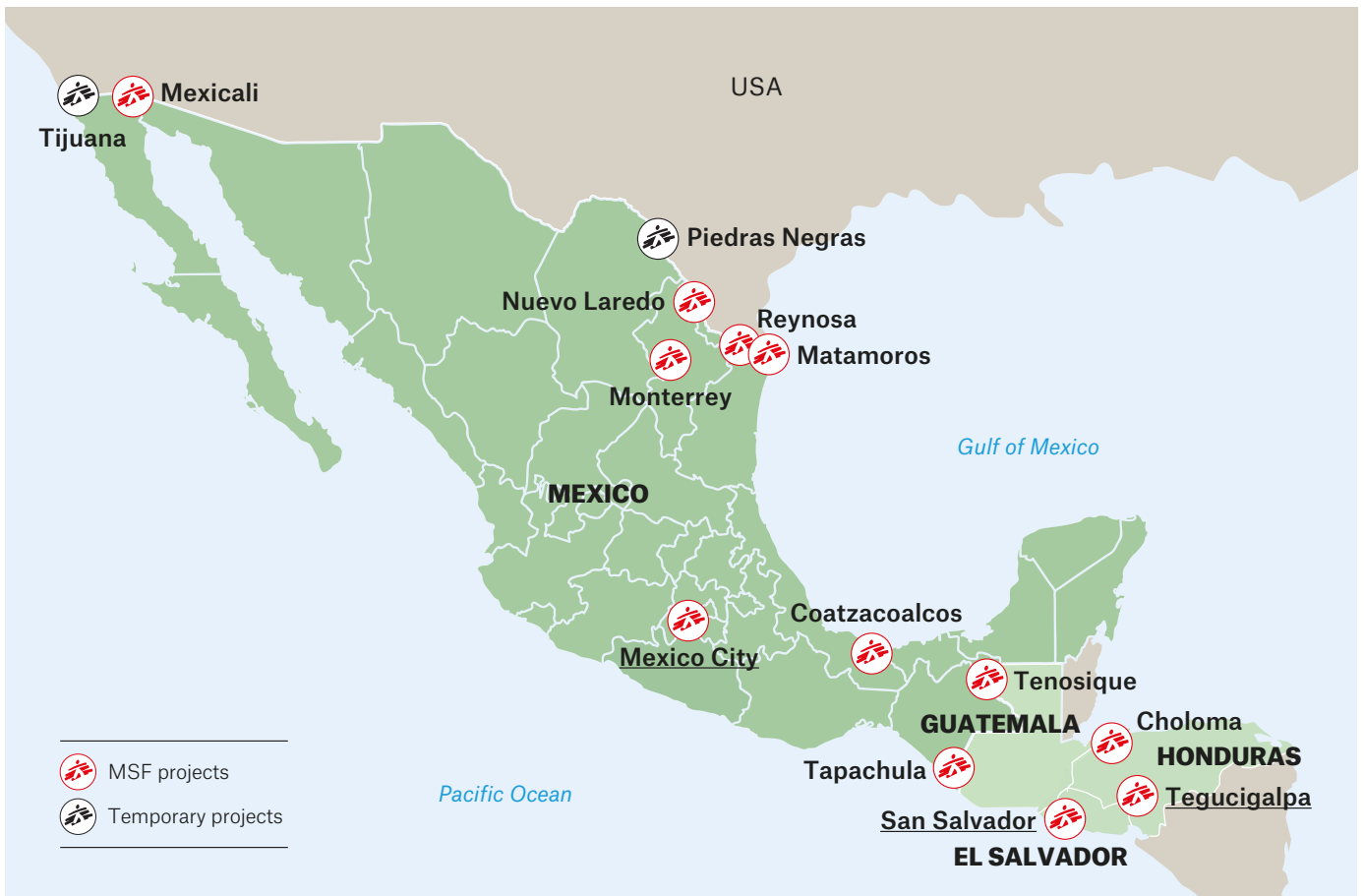
MSF projects and health posts in Mexico and Central America.